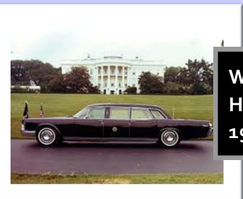
White House 1972