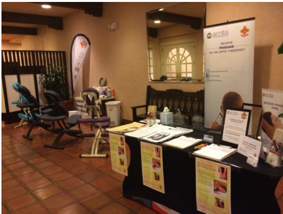
All ready at SIMPLE Conference