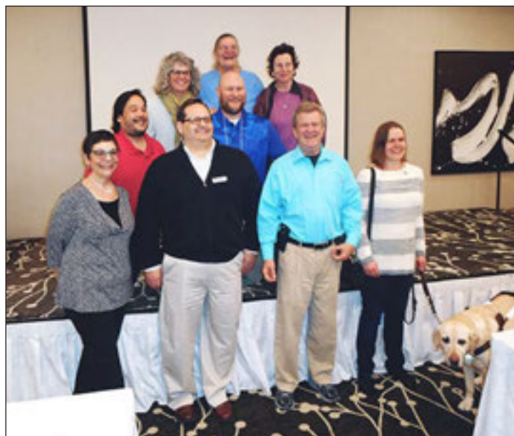
2016 Board Members, right to left, starting bottom row: