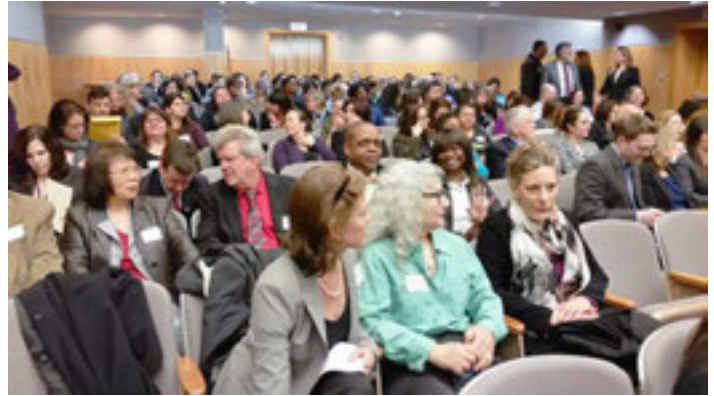
Massage Therapists at March 14, 2016 Calif. Legislature Hearing. State massage therapists attended and testified.

After this hearing, it is likely that the bill will be in its “final” form, meaning the one that the both houses of the legislature think are satisfactory. At this point, we will ask you to send an email to your Senator and Assemblymember. This email will either express your support for the fine job they have done in representing your interests, or politely ask them to make further changes.